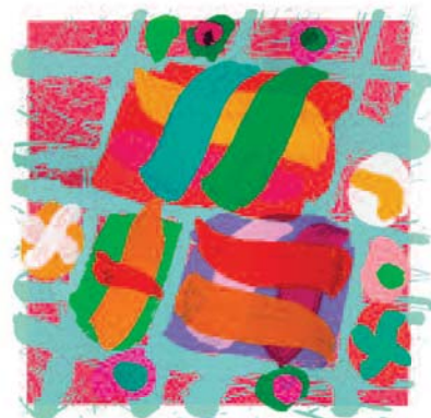
▲ Albert Irvin, Electra I , screenprint, 36x36cm