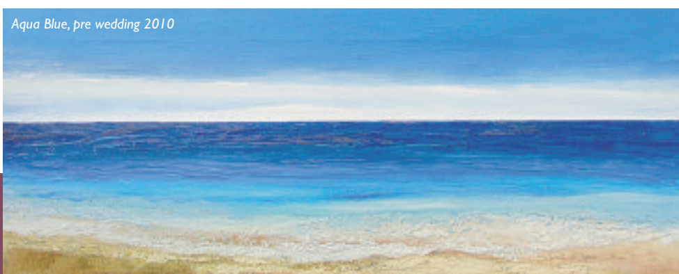
Aqua Blue, pre wedding 2010