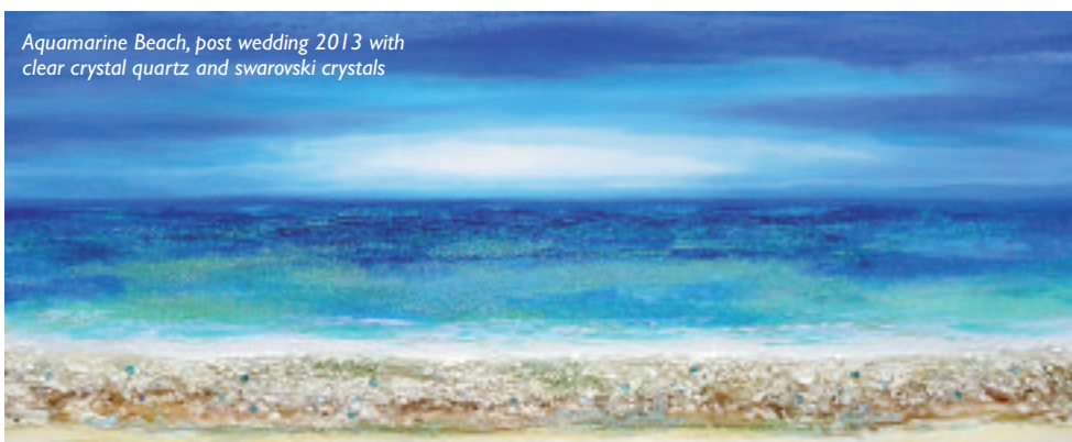
Aquamarine Beach, post wedding 2013 with clear crystal quartz and swarovski crystals

but I love it so it is worth it," she reveals. "The paintings are like my babies so it can be hard when I have finished to give them away but otherwise I would keep them all and I don't think my house is big enough for that."