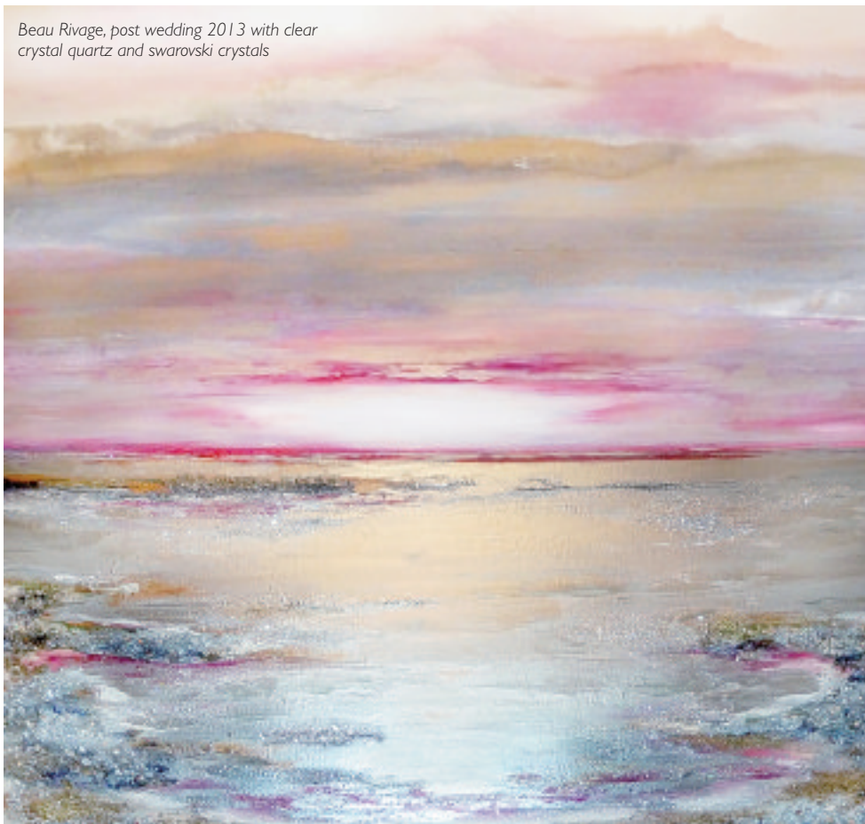
Beau Rivage, post wedding 2013 with clear crystal quartz and swarovski crystals