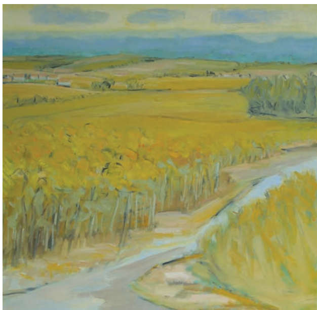
Landscape Haze with Sunflowers