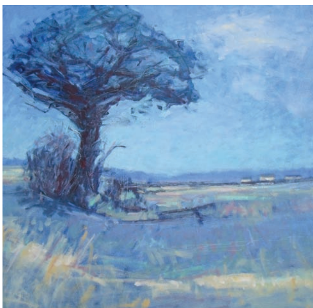
Umbrella Tree, Fading Light