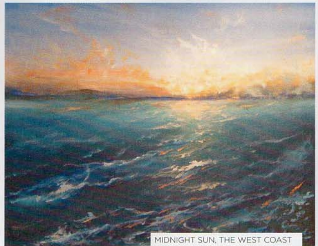
MIDNIGHT SUN, THE WEST COAST OF NORWAY BY ROY MACKINTOSH

www.surreyopenstudios.org.uk/artists/members.php?mem_id=666