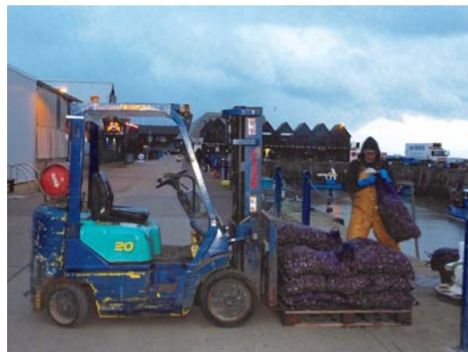
Collecting whelks at Whitstable Harbour

Watch the videos at www.travelwriter.biz