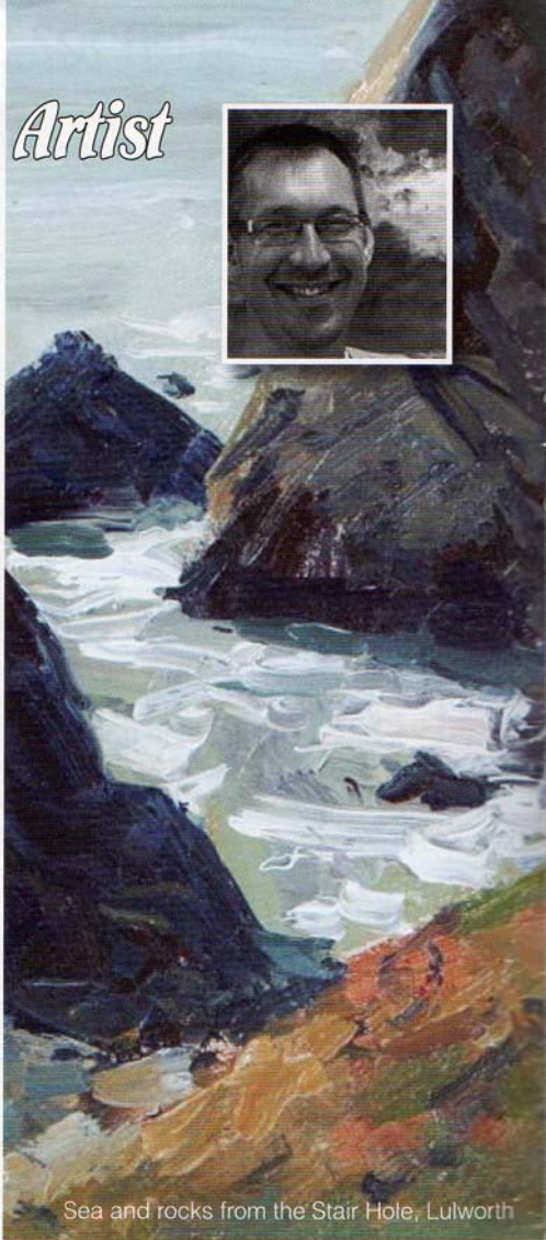
Sea and rocks from the Stair Hole, Lulworth