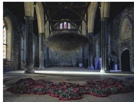
Cloud, Winchester Great Hall

Daisy's of Houghton (open now Houghton Lodge & Gardens, Stockbridge), refurbished tea house and orangery in 18th-century walled garden: cakes, specialist tea/coffee, freshly made soup, toasted sandwiches, panini, using fruit and vegetables from the walled garden www.houghtonlodge.co.uk